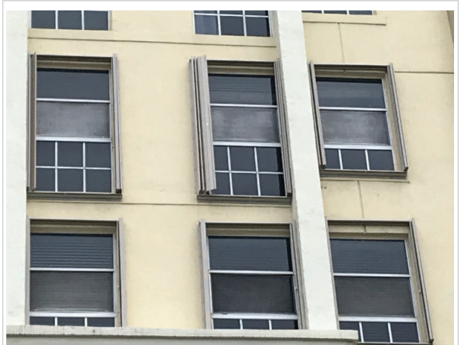
Protected Windows Showing Accordion Shutters