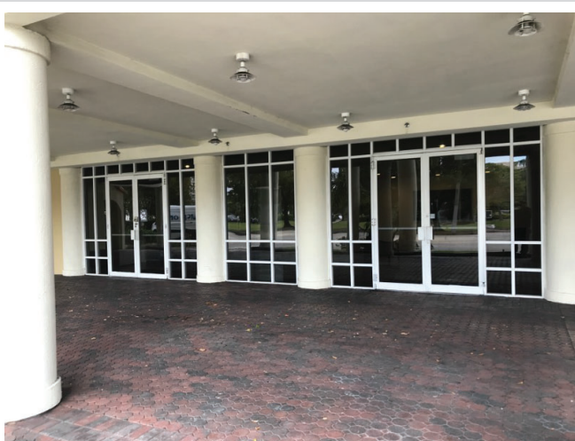
Non Protected Windows & Doors